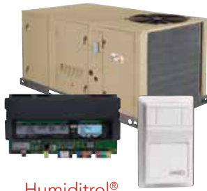
Humiditrol® dehumidification system